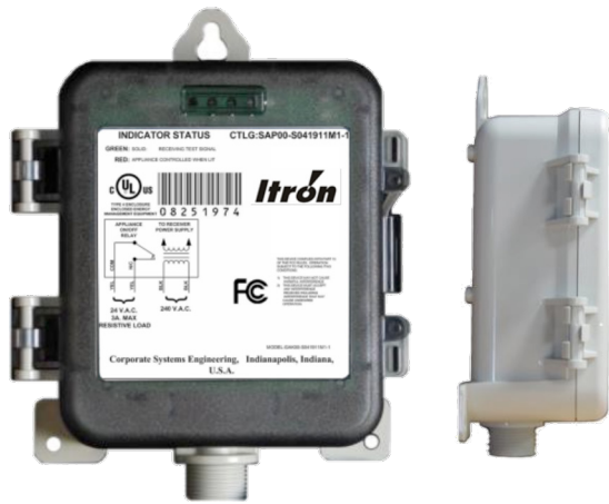
3/4" NPT Fitting