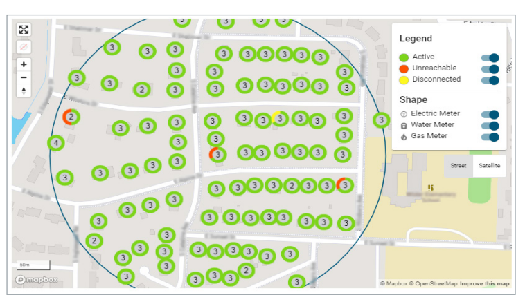
Map of nearby service points