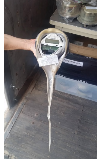
Effect of high-temperature

utilities. Operations Optimizer supports many outcomes such as AMI Operations, Network Operations, Revenue Assurance and Meter Temperature Monitoring. Operations Optimizer is available as a hosted solution and is integrated with Microsoft® Azure.