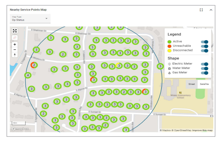
Figure 2: Map of nearby service points