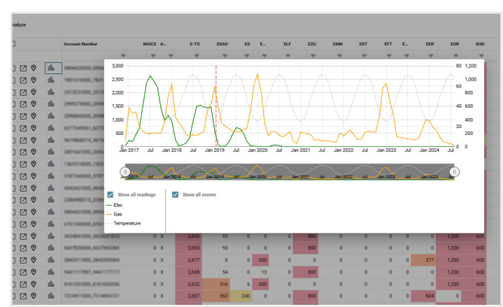
Figure 4: From the list view, quickly see load profile without having to open another screen