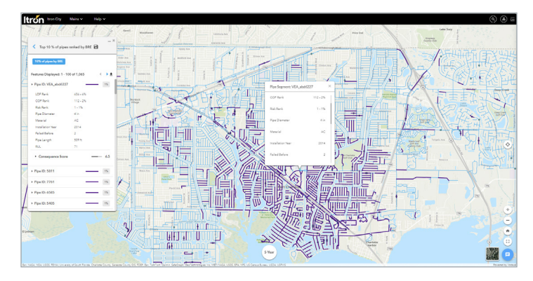
Al-driven analysis and interactive tools for management of pipe assets and capital planning.

Itron's Pipe Asset Management solution uses AI to provide a powerful tool for identifying and accurately predicting which pipe assets need to be prioritized for action. This intelligent, interactive tool uses existing data provided by the utility to create a highly accurate model to assist with making decisions: